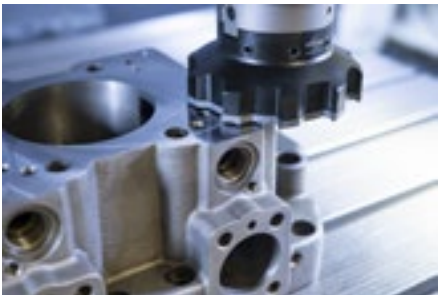
Part: Hydraulic housing (gray cast iron) Tool: MX boronite