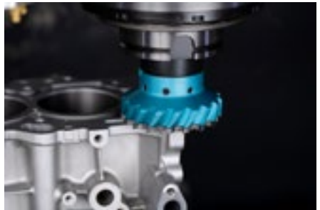
Part: Engine block (aluminum) Tool: MX diamond