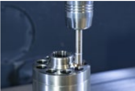
Part: Axial piston pump (steel) Tool: RX medium