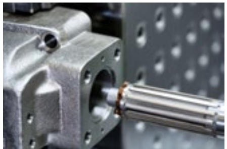
Part: Valve block (ductile cast iron) Tool: RH reamhone